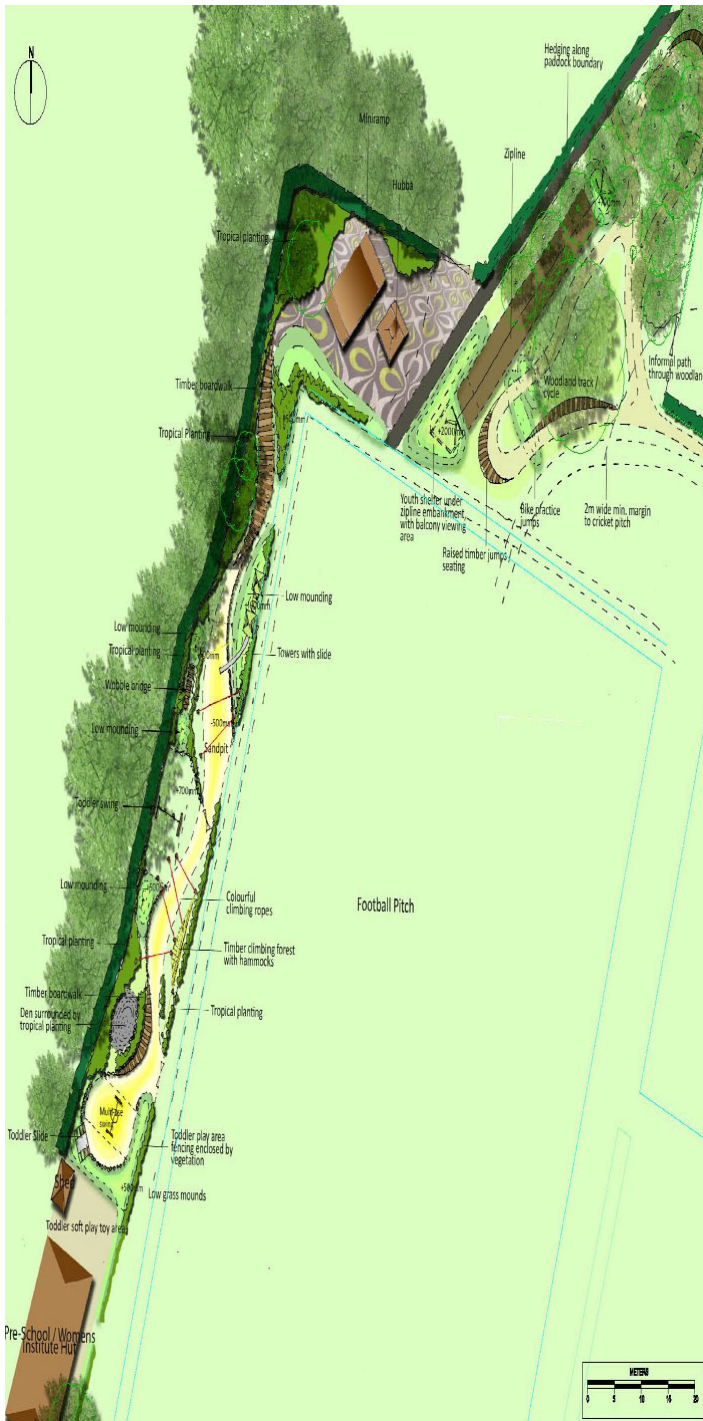
Above: Sketch Design (Rev E)